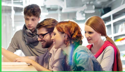
Discover EcoStruxure™ Customer Success Stories