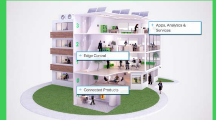
Discover EcoStruxure™ Building