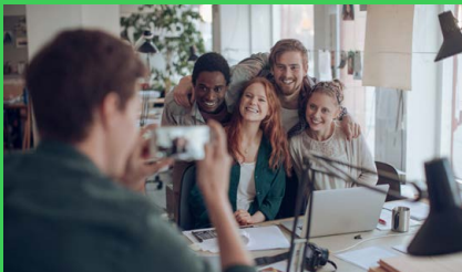
Contact us to start your journey