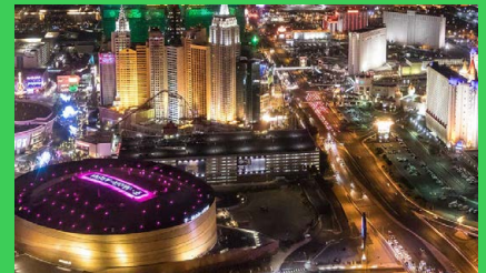
Experience T-Mobile Arena