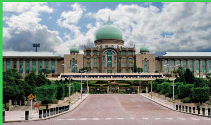
Explore Malaysia's Prime Minister Office